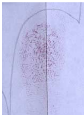
5-MTN (left, 3 g/L) versus ninhydrin (5 g/L) in daylight