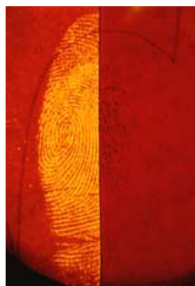
Fluorescence of 5-MTN after treatment with zinc chloride (green light/dark orange filter: MIC)

We found that the hemiketal of 5-MTN with ethanol dissolves much faster than 5-MTN (ninhydrin form) itself.