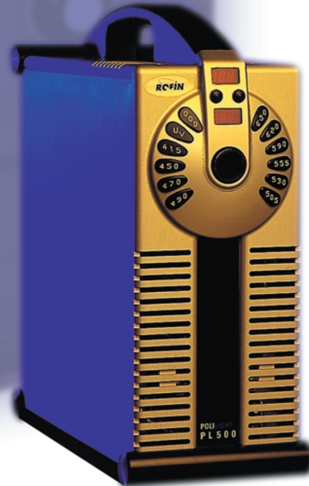
MAIN IMAGE : SHOWS THE NEW ERGONOMIC DESIGN AS COMPARED TO THE PREVIOUS MODEL.